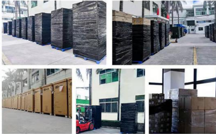
ATM Parts Professional Manufacturer