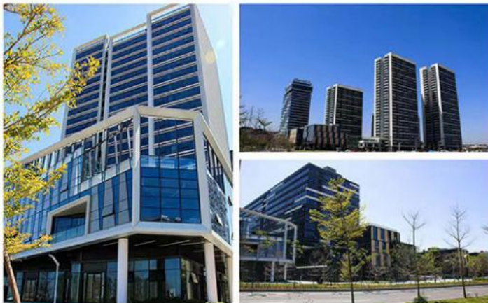
ATM Parts Professional Manufacturer