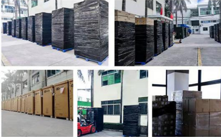
ATM Parts Professional Manufacturer