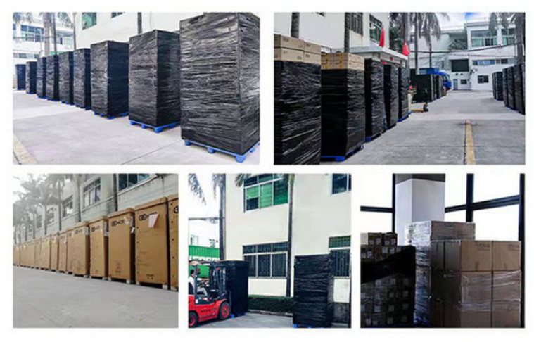
ATM Parts Professional Manufacturer