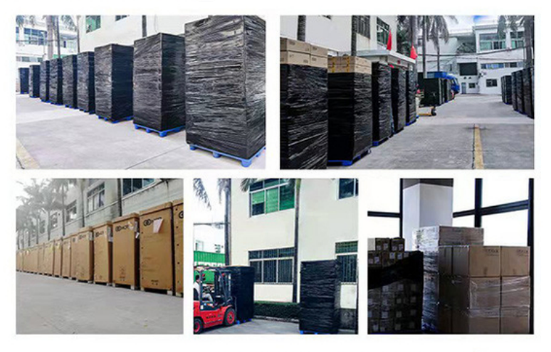
ATM Parts Professional Manufacture