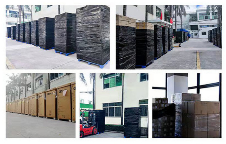
ATM Parts Professional Manufacturer