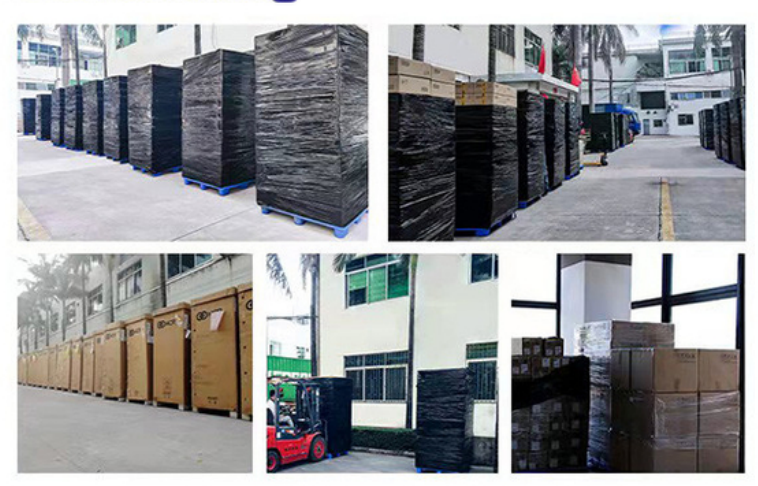
ATM Parts Professional Manufacturer