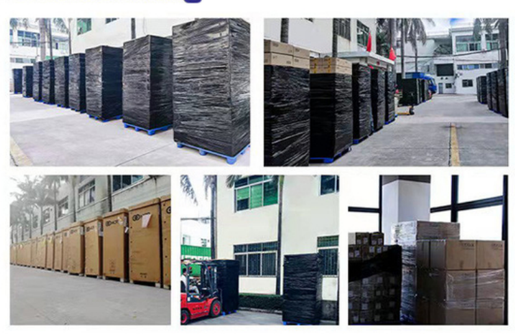
ATM Parts Professional Manufacturer