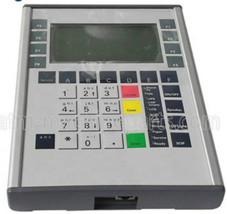
ATM Parts Professional Manufacture