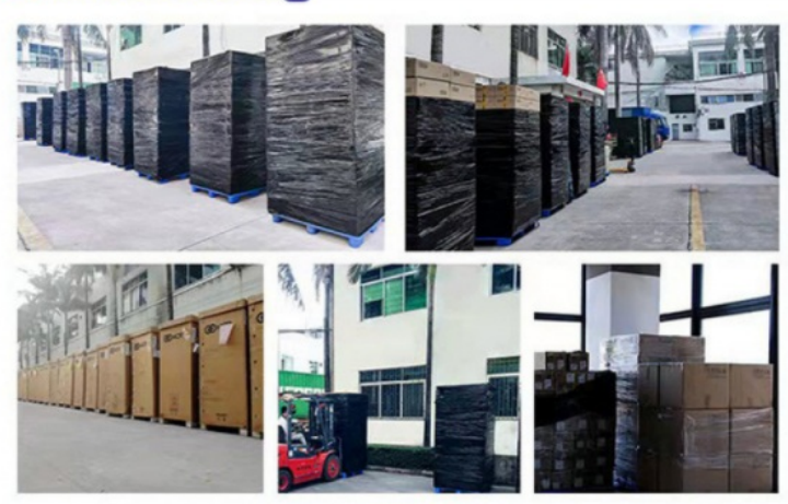
ATM Parts Professional Manufacturer