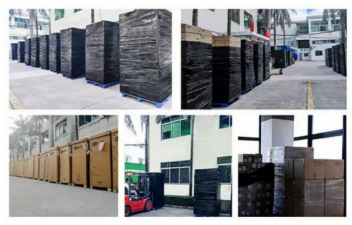
ATM Parts Professional Manufacture