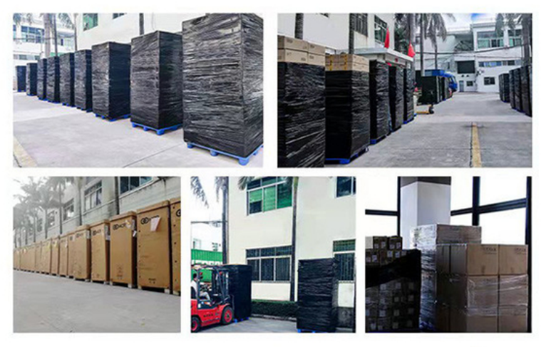
ATM Parts Professional Manufacturer