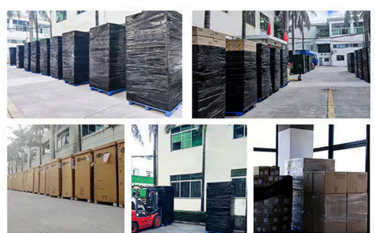
ATM Parts Professional Manufacturer