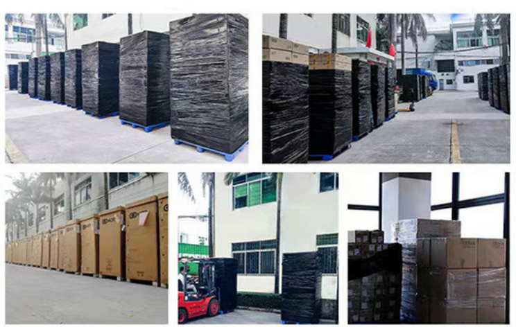
ATM Parts Professional Manufacturer