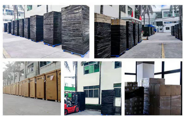
ATM Parts Professional Manufacturer