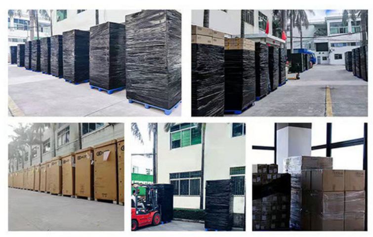
ATM Parts Professional Manufacturer