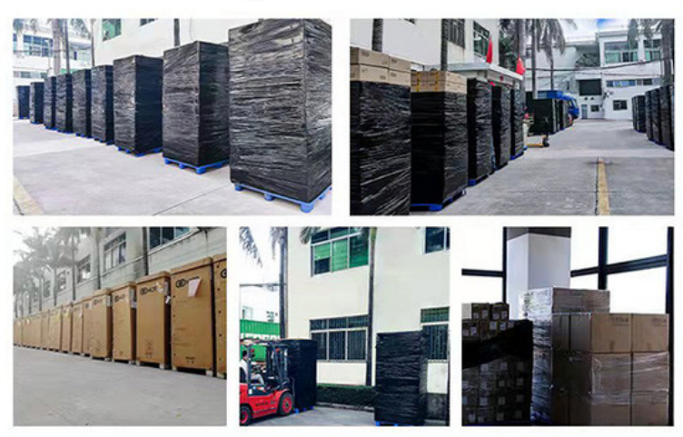
ATM Parts Professional Manufacturer