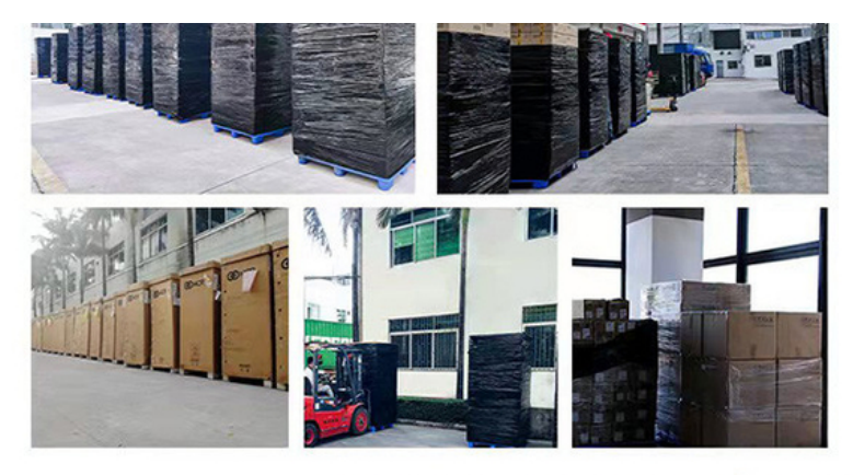
ATM Parts Professional Manufacturer