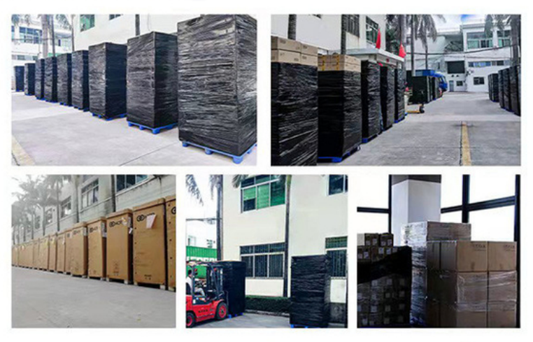
ATM Parts Professional Manufacturer