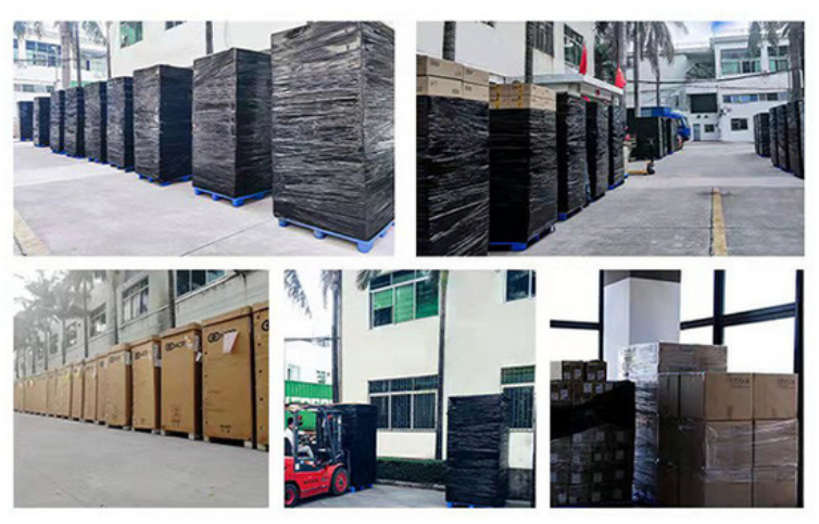
ATM Parts Professional Manufactures