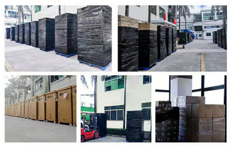
ATM Parts Professional Manufacture