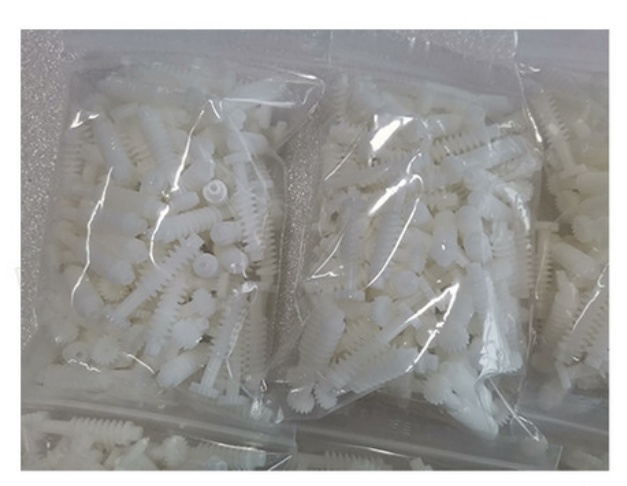
ATM Parts Professional Manufacture