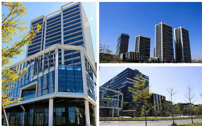
ATM Parts Professional Manufacturer