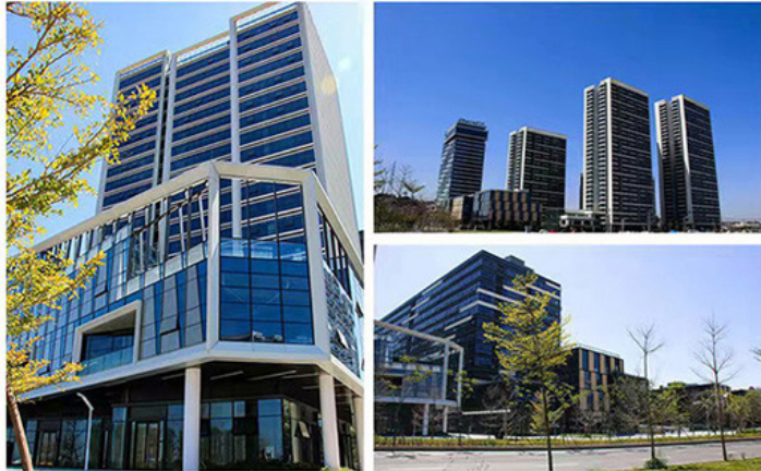
ATM Parts Professional Manufacturer