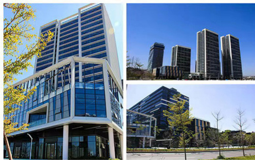
ATM Parts Professional Manufacturer