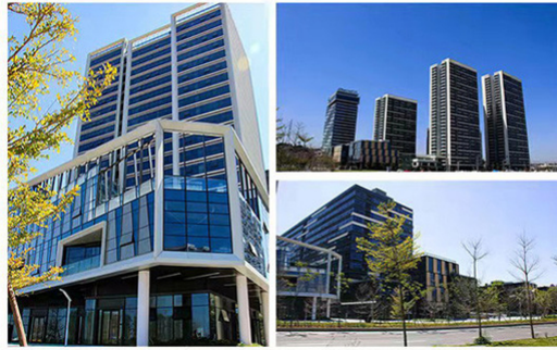
ATM Parts Professional Manufacturer