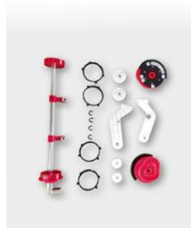
ATM Spare Parts