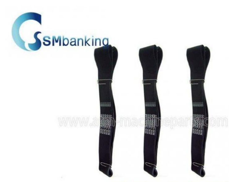
ATM Parts Professional Manufacture